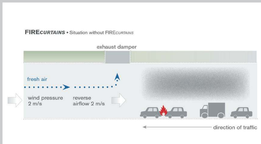
Figure 1: Situation without FIRECURTAINS