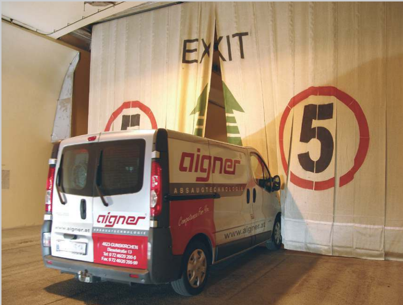
FIRECURTAINS in action