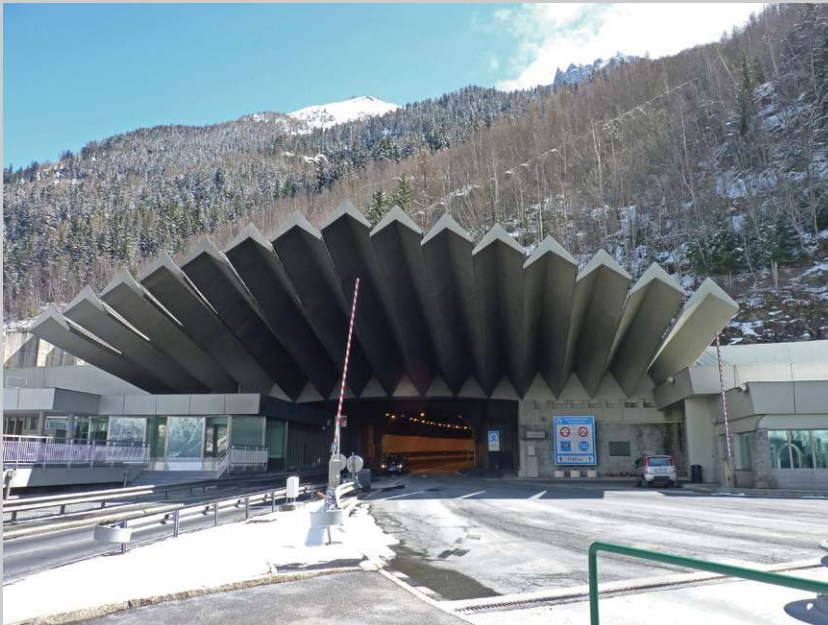
Exit portal - French side