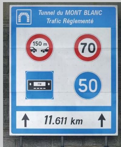
Caption tunnel Mont Blanc